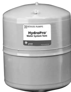
In-Line Models V6P V15P V25P V45P