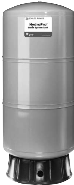
Stand Models V45 V140 V60 V200 V80 V250 V100 V260 V100S V350