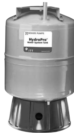
Mounted Pump Models V60MP V60PST V45MP V45PST