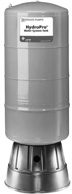
V80EX Stand Model with Base Extension