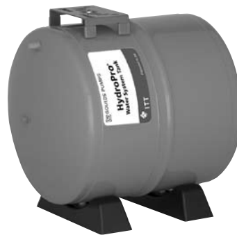
Horizontal Models with Pump Mounting V25H V45H V60H